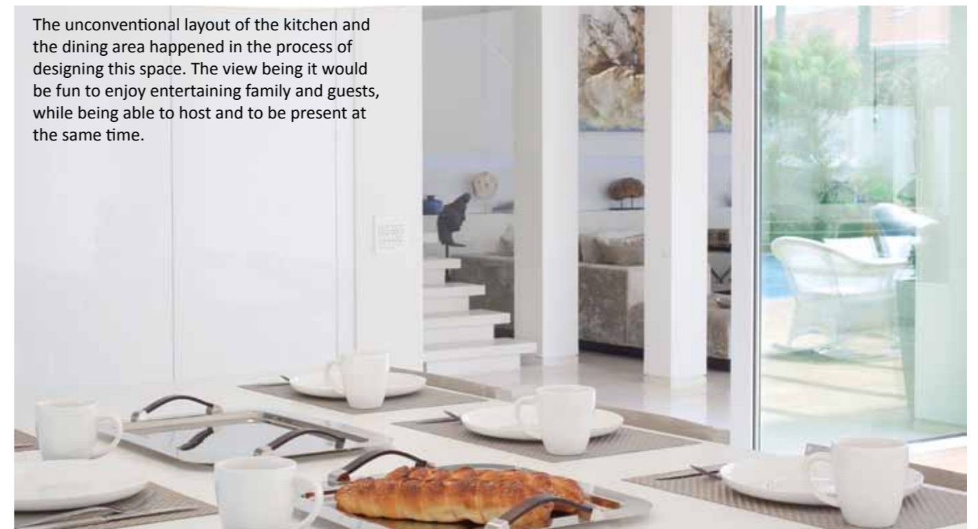
The unconventional layout of the kitchen and the dining area happened in the process of designing this space. The view being it would be fun to enjoy entertaining family and guests, while being able to host and to be present at the same time.