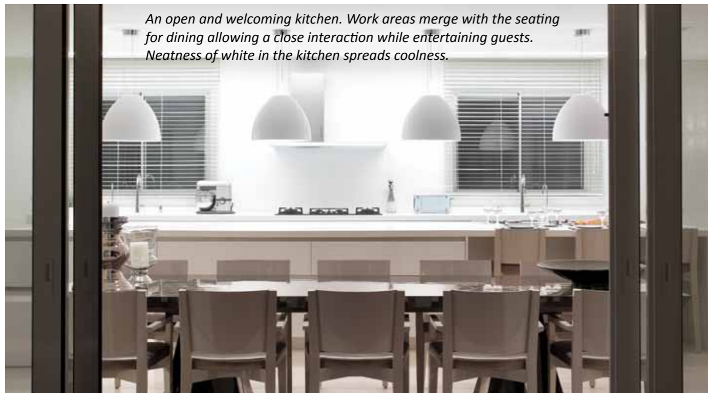
An open and welcoming kitchen. Work areas merge with the seating for dining allowing a close interaction while entertaining guests. Neatness of white in the kitchen spreads coolness.