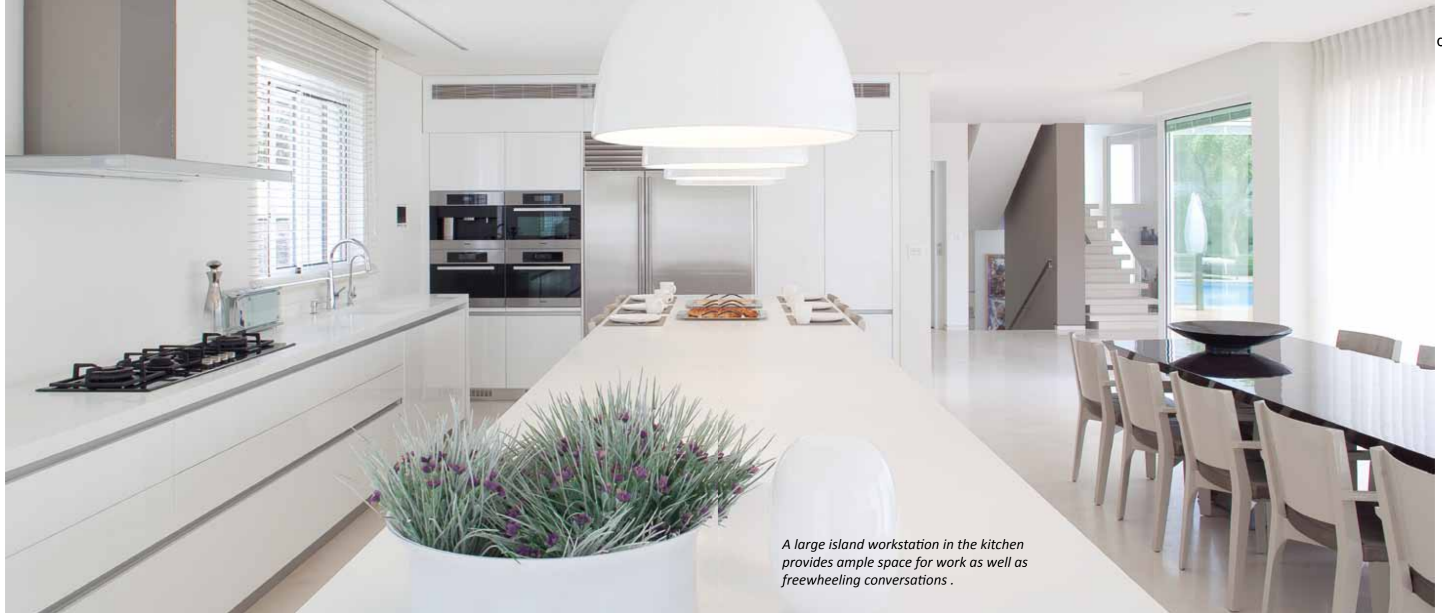
A large island workstation in the kitchen provides ample space for work as well as freewheeling conversations .