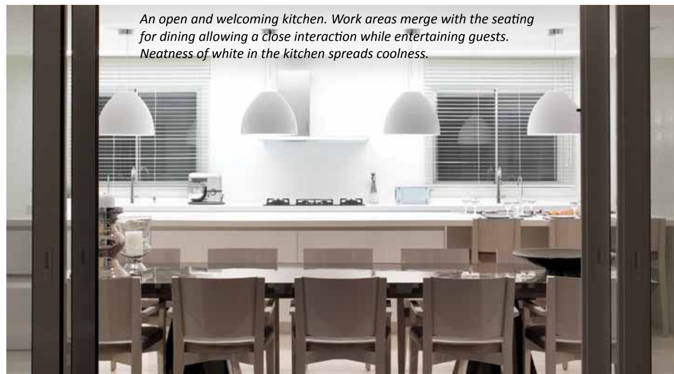
An open and welcoming kitchen. Work areas merge with the seating for dining allowing a close interaction while entertaining guests. Neatness of white in the kitchen spreads coolness.